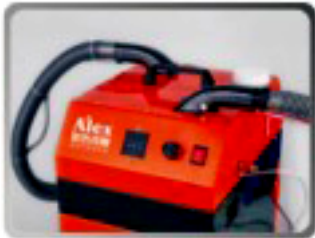
DOUBLE TRIMMING HEAD - DOUBLE MOTOR