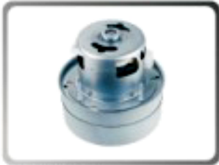
BRUSH LESS SUCTION MOTOR