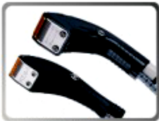
THE SUCTION AND CUTTING FUNCTION ARE INTEGRATED AND THREAD IS CUT CLEAN